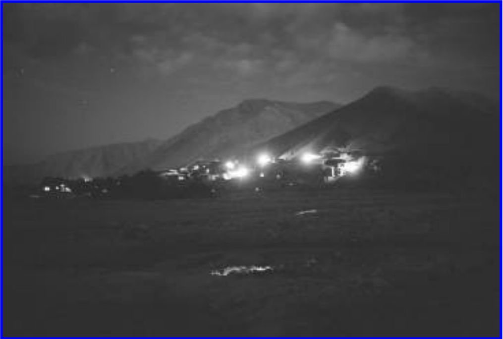
Solar electrified village at night.